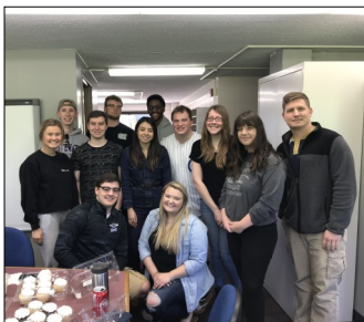
2019 Spring Send-Off

The Royal Purple office is open Monday - Friday from 9 a.m. - 5 p.m. during the academic school year at the University of Wisconsin-Whitewater. It is located in Room 113 of McCutchan Hall off Parking Lot 2 on North Prince Street.